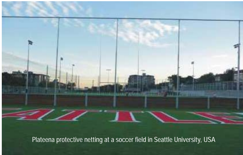
Plateena protective netting at a soccer field in Seattle University, USA